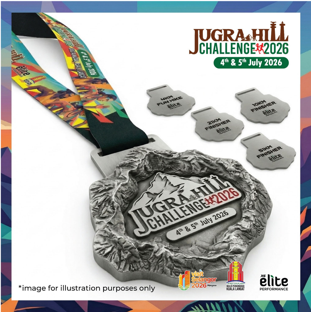
EVENT TEE DESIGN